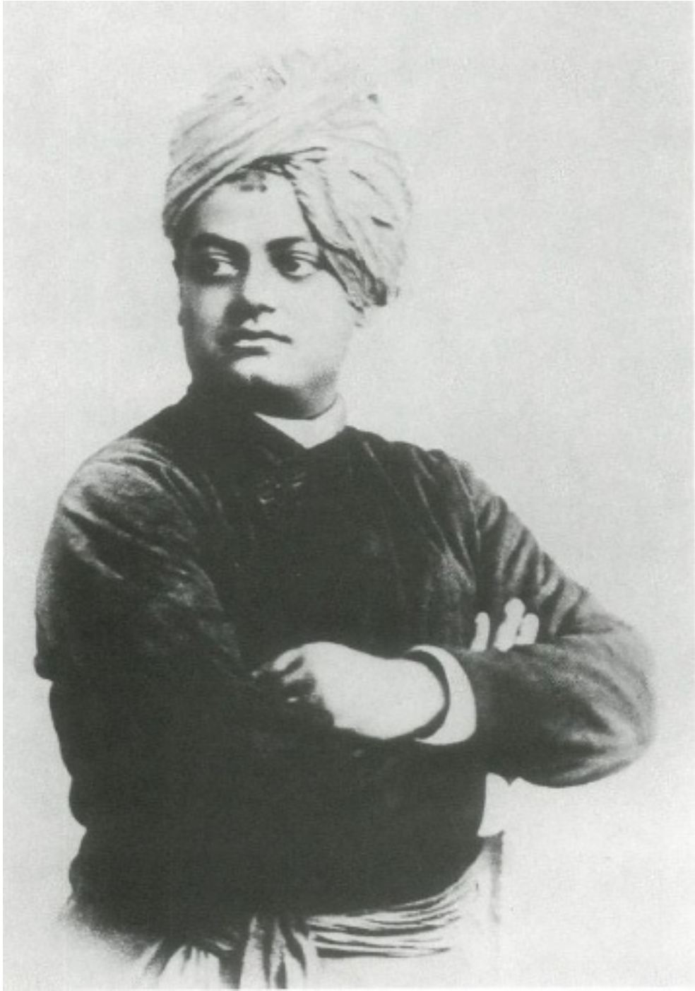
VIVEKANANDA AT THE PARLIAMENT OF RELIGIONS